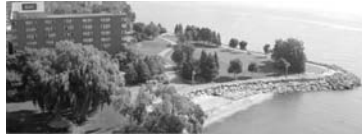
2020 Lakeshore Rd. Burlington on the Waterfront 905.631.6011